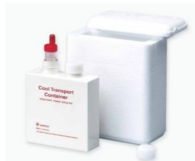
Figure 3. Transporting container