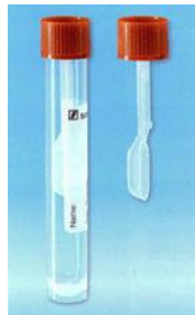
Figure 2. Colection tube