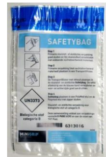
Figure 4. Safety bag